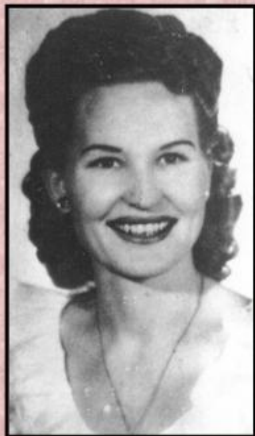
At age 25