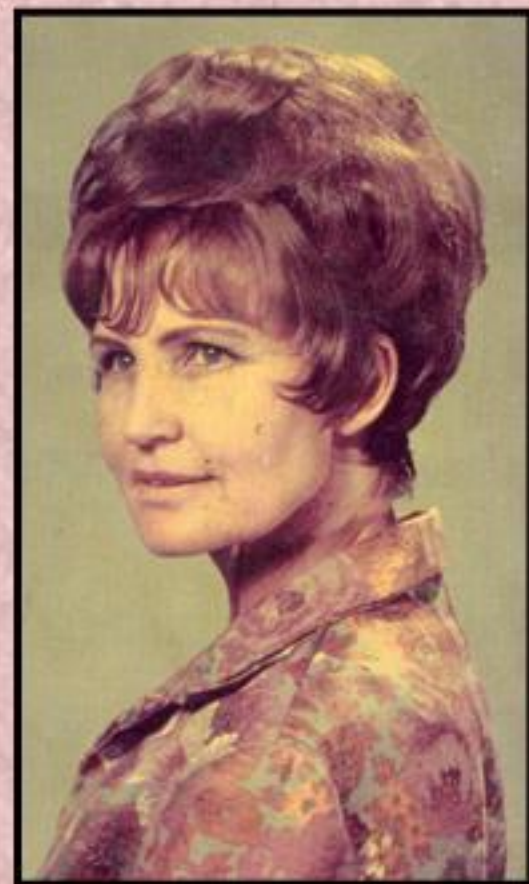
at age 45